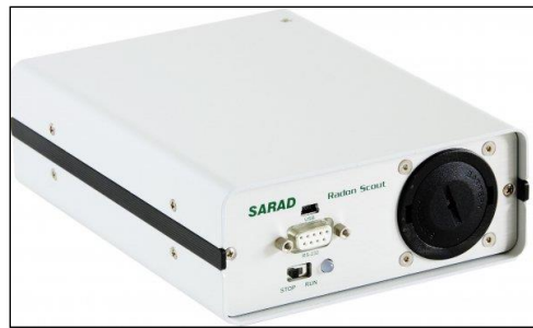
Figure- 2: Radon detector Radon Scout from SARAD GmbH

222 Rn air concentration was measured using portable device Radon Scout Plus meters device GmbH which made by SARAD company in Germany (Figure 2). The sensitivity of this device is 1.8 counts/ min× KBq/m 3 (independent on the humidity) and response time 120 minutes to 95% of the final value [9]. High sensitivity with alpha spectrometry analysis, leads to a short response time even at low concentrations. According to the measuring instructions provided by SARAD company, for continuous measurement; more than 3hours; the device should be placed in slow mode to increase the accuracy [10-11]. Measurement of 222 Rn concentration was done in 150 homes carried out for 3 hours by home. In sum, the 150 measurements of 222 Rn were done in indoor air of homes. 150 houses were in Atbara town residential area which consists of 27 residential areas.